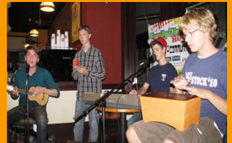
The Patrol, at Saxbys' CB Cares Night